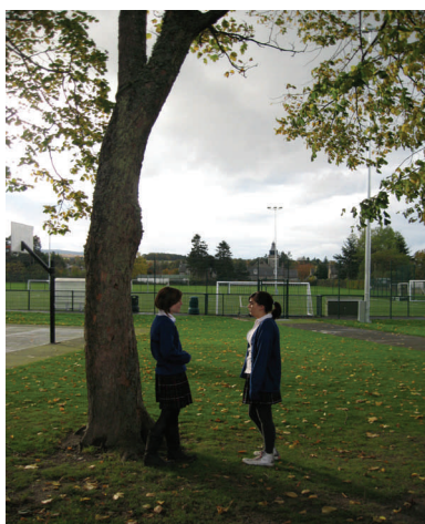
No thoughts of wintry weather as some senior students enjoy a mild autumn day in Speyside.